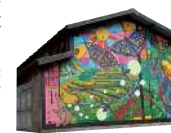
Wall painting on the farm toolshed