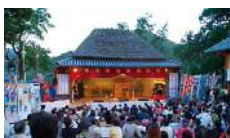
Nakayama Noson Kabuki Stage (farmers' kabuki stage)

This farmers' kabuki stage, designated as a national tangible cultural property on March 3 1987, is said to have been built, before the Tenpo era (before 1830), based on the design of the former Kanamaru-za Theater in Kotohira. The seats, located on a gradual slope, are divided by stone masonry. The costume storage contains 720 costumes, 62 wigs, 206 stage settings and stage properties. About 600 kabuki scripts are also preserved here. Nakayama Noson Kabuki play is performed at the beginning of October every year.