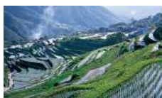
Senmaida Terraced Rice Fields

This is the only place in Kagawa prefecture that is designated as one of "the 100 Best Terraced Rice Fields in Japan". In a total hilly area of 12 hectare on the slope of the Yufune Mountain, magnificently beautiful curves are created by about 800 large/small rice fields terraced from an elevation of 250 meters to 150 meters. It is also said that the rice grown here is very delicious thanks to the spring water from the Yufune Mountain which is known as "Yufune no Mizu" selected as one of "the 100 Best Spring Waters in Japan".