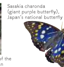
Sasakia charonda (giant purple butterfly), Japan's national butterfly