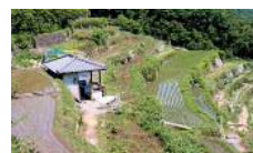
Communal Washing Place

Communal washing place stands in the terraced rice fields. It serves as a place for washing vegetables and clothes. It also serves as a place for local people to relax meeting up after a day's work, where they can enjoy chatting cheerfully around a washing place while washing vegetables.