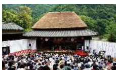
Hitoyama Noson Kabuki Stage (farmers' kabuki stage)

Shodoshima kabuki play has a history of over 300 years since the Edo period. There used be stages across the island, however, only two of stages survive today: one in Nakayama area and one in this Hitoyama area. This stage in Hitoyama, designated as national tangible cultural property, has a structure with a hipped thatched roof like the stage in Nakayama but it is a little larger than the stage in Nakayama. The farmers' kabuki play in Hitoyama is performed on May 3 every year.