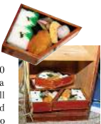
Warigo bento lunchbox

Nakayama Noson Kabuki is said to have originated 300 years ago (in the mid Edo period). According to a remaining record, there were totally 30 large and small kabuki stages and 600-700 actors in the entire island during the Meiji and Taisho periods (late 19th century to early 20th century). However, today, stages exist only in Nakayama area and Hitoyama area.