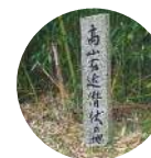
Stone monument of the hiding place

Various measures to increase a natural population of fireflies have been taken, such as incubating and stocking larvae of fireflies. Today, you can see the fantastic dance of fireflies such as Luciola cruciata, Luciola lateralis, and Hotaru parvula for a month from the end of May. Nearby, there is a farm toolshed with a wall painting of insects based on the concept of the Home of Fireflies. In addition, the island people continuously make efforts to improve habitat environment hospitable for wildlife such as Sasakia charonda (giant purple butterfly) that is Japan's national butterfly but vanished in this island, as well as restoration of narcissus fields.