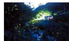
Nakayama - Home of Fireflies

Various measures to increase a natural population of fireflies have been taken, such as incubating and stocking larvae of fireflies. Today, you can see the fantastic dance of fireflies such as Luciola cruciata, Luciola lateralis, and Hotaru parvula for a month from the end of May. Nearby, there is a farm toolshed with a wall painting of insects based on the concept of the Home of Fireflies. In addition, the island people continuously make efforts to improve habitat environment hospitable for wildlife such as Sasakia charonda (giant purple butterfly) that is Japan's national butterfly but vanished in this island, as well as restoration of narcissus fields.